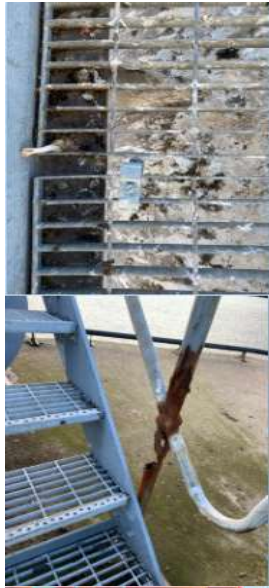
Section 2 of the bridge: R/Hand Handrail Station is severely corroded and in need of repair / replacement