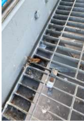
Example of clamps positioning